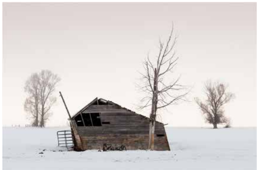
Ginny Campbell, LRPS Lymington Camera Club Worn Out